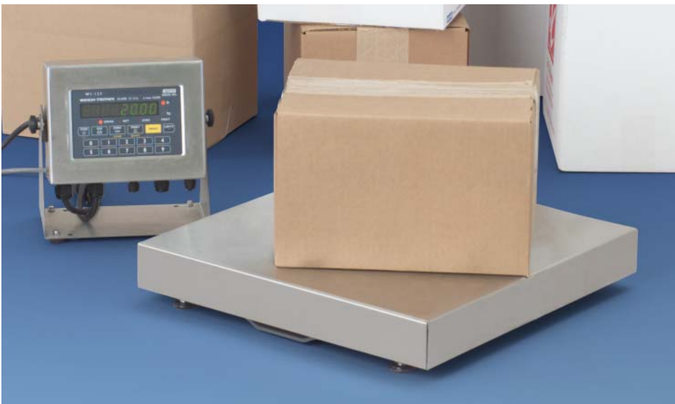
3735LP model shown with optional Avery Weigh-Tronix WI-125 indicator.

NTEP Pending (5,000 divisions Class III, C.O.C. # 02-069), UL/CUL