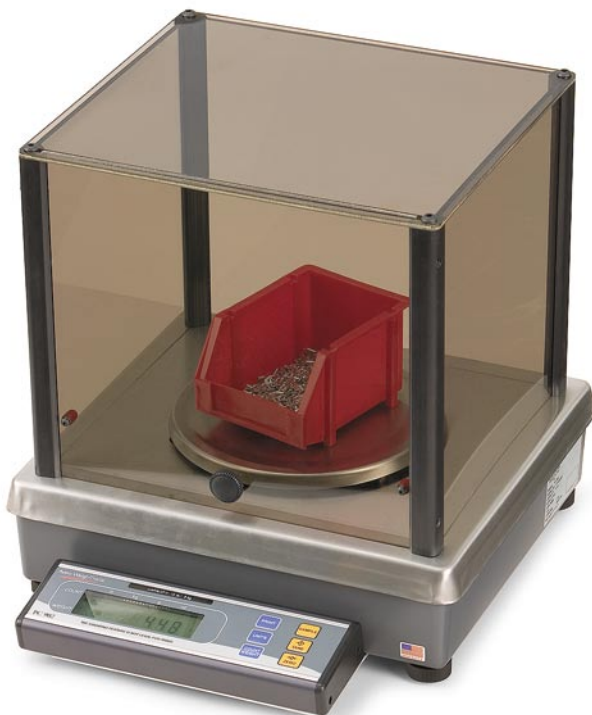
PC-902 with draft shield.

Maintaining quality control is also critical. Companies want to give their customers exactly what they paid for. Time and again, shipping less than ordered leads to dissatisfaction and lost customers. Accuracy translates to freeing up of capital and satisfied customers.