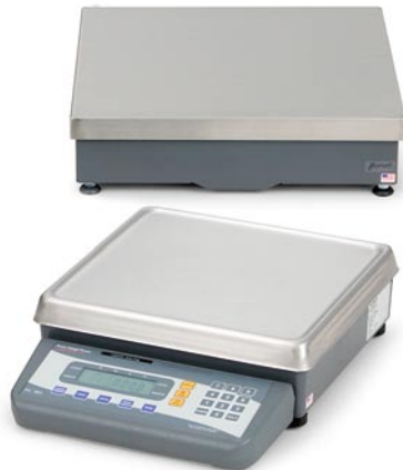
PC-905 with optional remote base.

Lets operators enter and recall known piece weights and tare weights.